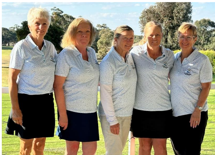
NEDGA; 14 April at Yarrowonga