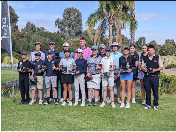
JNJG Open Masters Tournament at Howlong 27 & 28th April All the winners